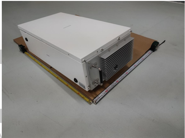
Radiator style 3 散热器款式 3