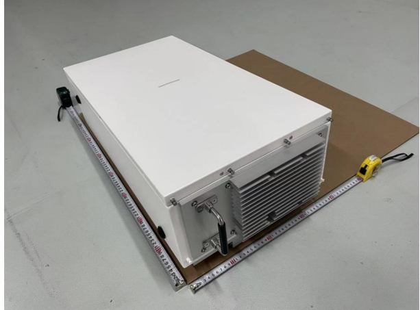
Radiator style 2 散热器款式 2