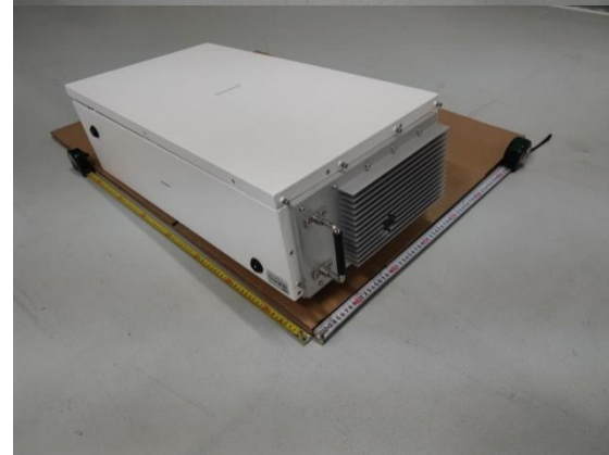
Radiator style 3 散热器款式 3