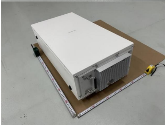
Radiator style 1 散热器款式 1