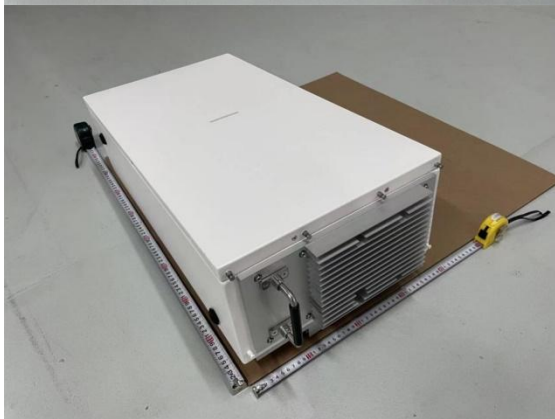
Radiator style 2 散热器款式 2