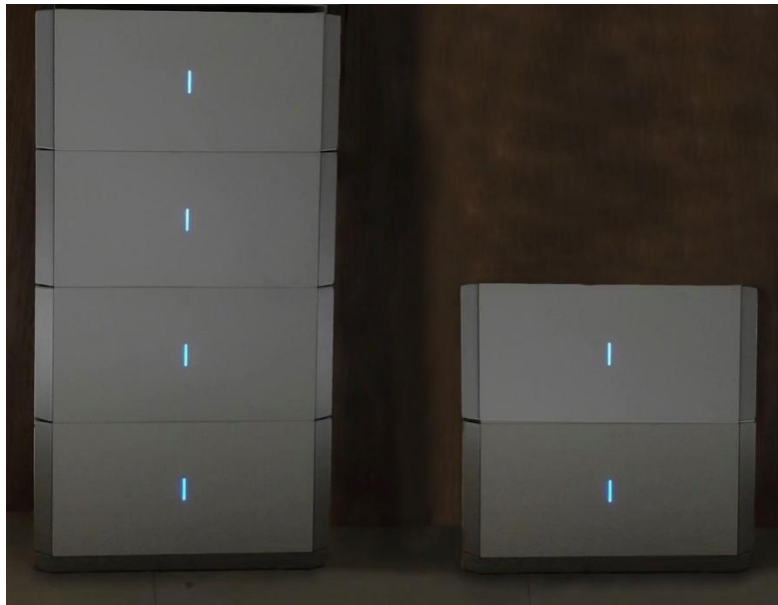
Model: iHome B30