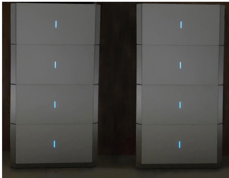
Model: iHome B40