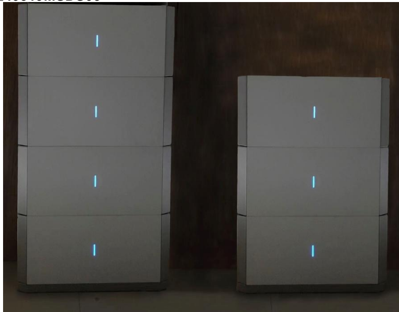
Model: iHome B35