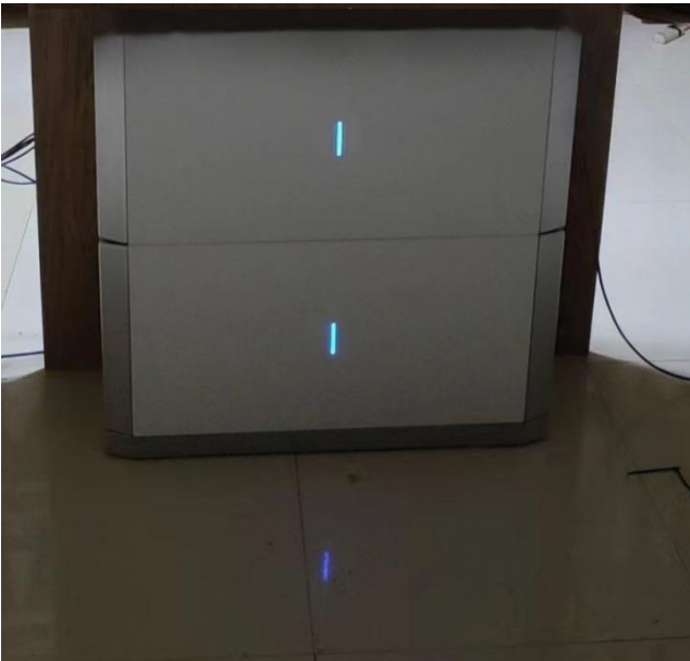
Model: iHome B10