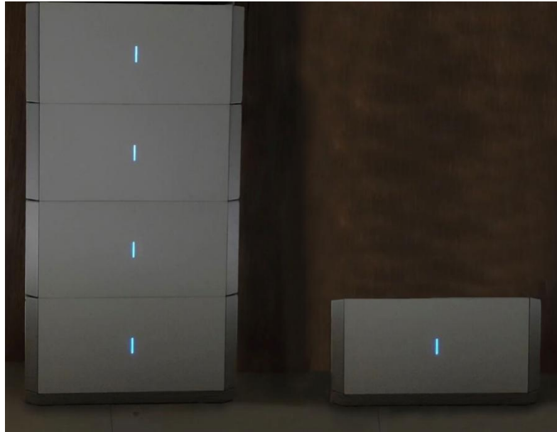
Model: iHome B25